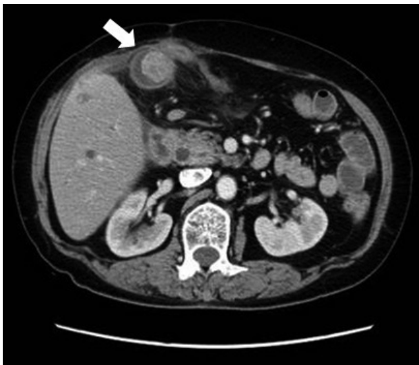
Fig. 1. Abdominal computed tomography shows an enterolith (white arrow) measuring 3 cm in the proximal afferent loop.

Because the patient was septic and her condition was unstable, we performed urgent percutaneous transhepatic biliary drainage (PTBD). A 10 Fr pigtail catheter for PTBD was passed over the guide wire and placed in the jejunal limb through B6