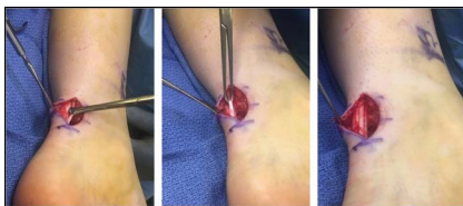
Intraoperative images showing the open left plantaris tenotomy. The plantaris tendon was identified medial and adjacent to the Achilles tendon. The tendon was dissected free from the Achilles and is shown being held by an Allis clamp before tenotomy.