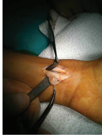
FIGURE 3: Intraoperative view of the lesion showing that the mass at the wrist was originated from the median nerve.