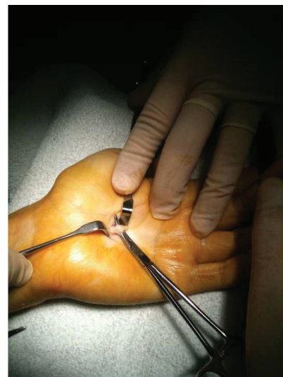
FIGURE 4: Intraoperative view of the lesion showing that the mass in the palm was originated from the common digital nerve of the 3rd and the 4th fingers.

finger and on the radial side of the 4th finger. The lumps were nontender with no radiating pain. A positive Tinel sign at the wrist and palm and a Phalen sign were spotted. There was no objective motor deficit. There was no family history of neurofibromatosis and no associated clinical features. USG revealed a 12 × 14 mm mass at the volar side of the wrist and 4 × 5 mm mass in the palm which both were in close relation with flexor tendons and had no blood supplies. MRI revealed a 11 × 9 mm mass located in flexor tendons which has intermediate signal on T1-weighted images and hyperintense signal on T2-fat weighted images (Figure 1). Also a second 6 mm diameter mass in the palm with the same properties