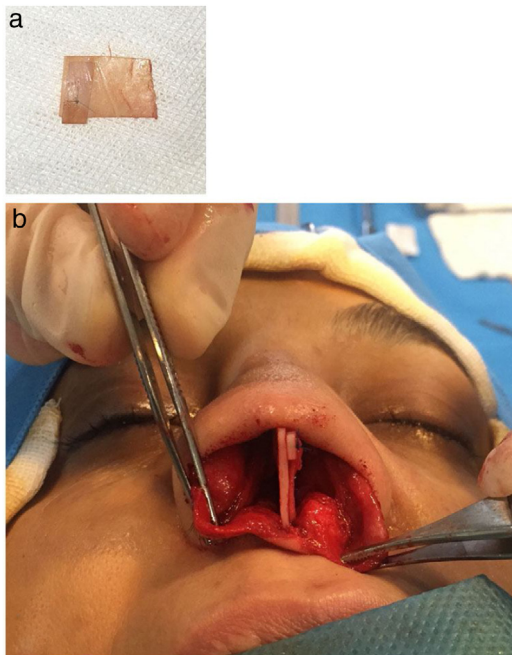
Figure 2 (a) Prefabricated caudal extension graft made by suturing a bar graft on it; (b) the bar graft is placed on the left side of the caudal septum and fixed in the empty space between the septum and caudal graft.