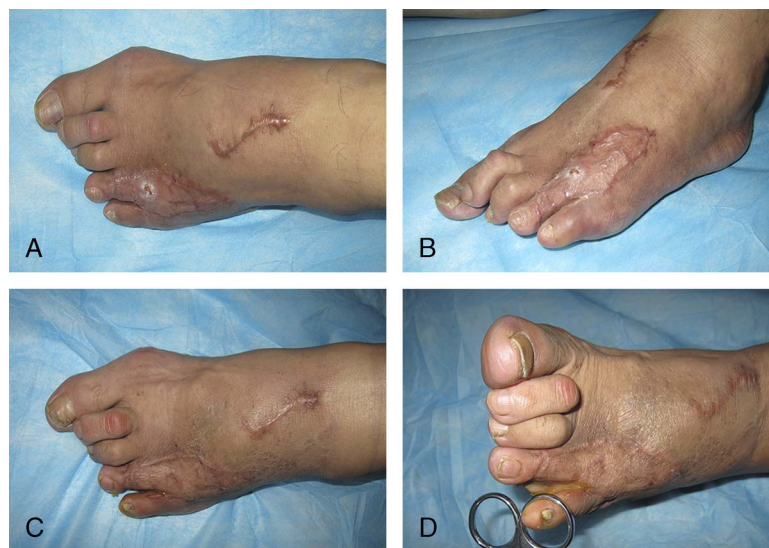
FIGURE 3. Follow-up showed that the flap and grafted skin survived well. A and B, 3 months; (C) and (D), 6 months. full color online

Distal foot problems vary in severity and complexity, and several local and distant reconstructive strategies have been proposed for resolving these problems. Obviously, skin graft is not suitable for severing as coverage in distal foot, because the durability could not meet functional requirements and may lead to recurrent ulceration of the area. 14 Therefore, local flaps are commonly used. The filleted and partial filleted toe flaps are useful for reconstruction of minor defects, but their use would jeopardize the toes themselves. 15,16 The reverse dorsal metatarsal artery flap, webspace neurovascular island flap, and distally based dorsalis pedis flap could be chosen for repairing distal foot defects, but