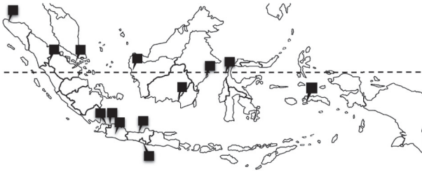
FIGURE 1: Location of ILI sentinels in 13 provinces in Indonesia.

There are limited studies on viral pathogens of respiratory tract infection in low-middle income countries including Indonesia. Previous studies have been conducted mostly focused on specific viral pathogens, especially influenza [6, 23, 24]. The prevalence of noninfluenza respiratory infections is relatively unknown. Therefore, this study has an objective to investigate the prevalence of viral etiologies from ILI cases in Indonesia.