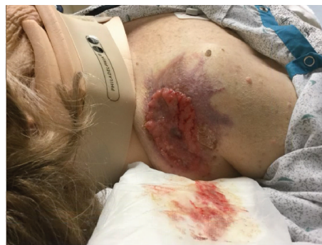
FIGURE 1: Clinical image of the patient’s fungating right shoulder mass, noted on presentation and measuring 6.1 × 5.5 cm. This had reportedly been present many years, with 2 years of noted increasing size, drainage, and friability.

In addition to the previously imaged osseous lesions, a technetium bone scan performed on HD4 demonstrated metastatic lesions in the right and left mid femoral shafts (Figure 3). CT of the right femur without contrast performed