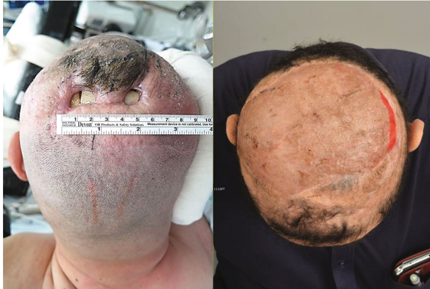
FIGURE 2: Preoperative scalp wound and postoperative photo showing complete wound healing after LD muscle-free flap and STSG (LD: Latissimus dorsi; STSG: split-thickness skin graft). Published with the patient's consent.