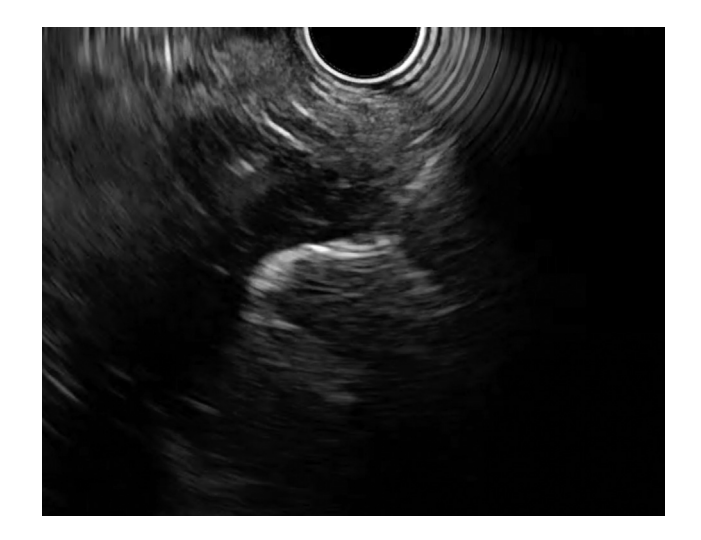
Figure 1. Endosonographic image showing deployment of the lumenapposing metal stent into the small bowel during creation of the jejunojejunostomy.

This case posed unique challenges because the Rouxen-Y gastric bypass anatomy made access to the ampulla difficult with conventional endoscopy. Alternative options considered were laparoscopic-assisted ERCP and balloon-assisted enteroscopy with ERCP, both of which have significant limitations. Laparoscopic-assisted ERCP requires significant logistical coordination, is costly, and leads to a longer recovery period for patients. Balloon enteroscopy-assisted ERCP is technically difficult, is time-consuming, and has demonstrated dismal rates of technical success. To further complicate the situation, the patient had undergone a sleeve gastrectomy before revision to Roux-en-Y gastric bypass; thus, the working