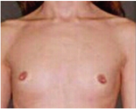
FIGURE 2: Lack of breast development.

significant medical illness in the family. She also had a deep voice. On examination, blood pressure was 110/70 mmHg without significant asymmetry or postural variation with palpable pulses in all extremities. She weighed 71 kg and her height was 174 cm with a body mass index of 23.5 kg/m 2 . General physical examination was within normal limits (no features suggestive of hypothyroidism, Cushing's syndrome, or acromegaly). Her Tanner staging was B2P4A2. External genitalia examination revealed clitoromegaly (4 cm) and ambiguous genitalia (Figures 1 and 2). Gonads were palpable in the inguinal canal bilaterally. She underwent a gynaecological examination which showed a 5 cm blind vaginal pouch. Ultrasonogram of abdomen and pelvis showed atrophic uterus and bilateral ill-defined gonad-like structures high up in pelvic.