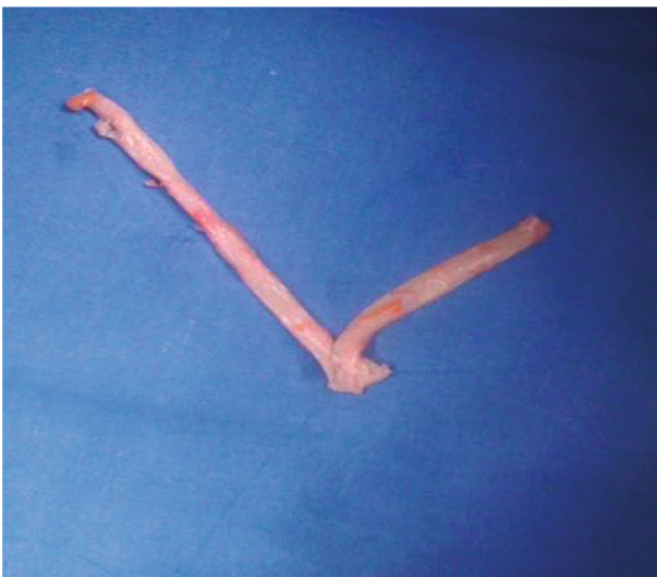
FIGURE 2: Great saphenous vein prepared to replace the carotid bifurcation.

The procedure was performed in general anesthesia, and cerebral perfusion was detected by Near-Infrared Spectroscopy (NIRS). We introduced through the femoral artery a catheter balloon 5 mm for bleeding control of carotid bifurcation. We reconstructed the carotid bifurcation using the vein graft already prepared. Before surgery, we studied the caliber of veins in the upper and lower limbs using ultrasound. We found a satisfactory left great saphenous vein in the right thigh. The saphenous vein was harvested and reversed. We recreated a carotid bifurcation using three segments of the vein. The vessels are being sutured end to end with the parachute technique using Prolene® 6/0 diameters (Figure 2). Classic incision of anterior sternocleidomastoid muscle was performed. We interrupted the blood circulation using the catheter balloon just for the time of dissection of the mass and to achieve the control of internal, external, and com-