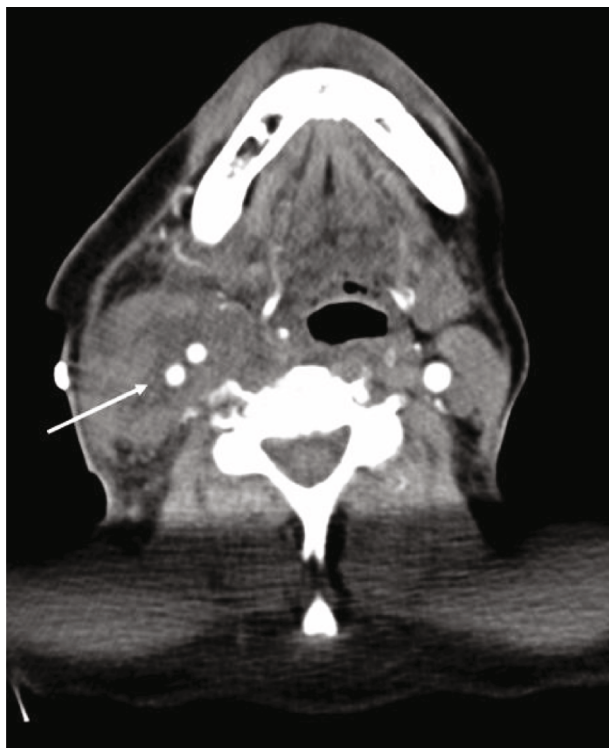
FIGURE 4: After 1 month from surgery, Computed Tomography (CT) scan shows good patency of the graft (arrow).