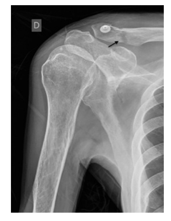
Figure 2. X-ray image of the right shoulder. A wide, lucent fracture line without dislocation between the fragments is seen at the distal third of the right clavicle (black arrow). The X-ray was taken during the patient's first visit to the emergency department and was misinterpreted as normal.

third of the clavicle was diagnosed (Figure 2). In order to assess the anatomical relations between the collection of fluid and its adjacent structures and to better evaluate the extent of bone involvement, we immediately performed an MRI on a Signa scanner 1.5 T (General Electric Medical Systems, Milwaukee, WI). The imaging protocol was performed using a short tau inversion–recovery sequence (coronal plane), a T_2 fast relaxation fast spin-echo (FSE) fat-saturated sequence (axial plane) and a T_1 FSE sequence (coronal plane) before i.v. application of the paramagnetic contrast media, and afterwards with a T_1 FSE fat-saturated sequence (coronal, axial plane). The MRI confirmed osteomyelitis of the clavicle and moderate right-sided pleural effusion (Figure 3a,b). Apart from these MRI findings, the X-ray of the lungs also showed radiological signs of possible infiltration of the right lower lobe.