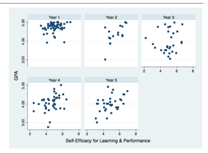
Correlations between Self-efficacy for learning performance subscale of motivation and academic performance, stratified by Academic year

Further analysis showed an effect of some factors on the relationship between academic performance and task value subscale of motivation. As shown in Table 3, the correlations between academic performance and task value subscale of motivation was statistically significant only among male students (r = 0.1969, p = 0.0265) compared to female, students aged above 23 years (r = 0.4763, p = 0.0068) compared to other age groups (Figure 2), students of the first and last academic year (r = 0.3324, p = 0.0123 and r = 0.5066, p = 0.0022, respectively) compared to students of middle years, and students living with their families (r = 0.2300, p = 0.7575) compared to those living in other types of accommodation. In regard to SES, this correlation was statistically significant only among students who perceived their family SES as middle and upper classes (r = 0.2839, p = 0.0042 and r = 0.4159, p =0.0116, respectively) compared to lower class.