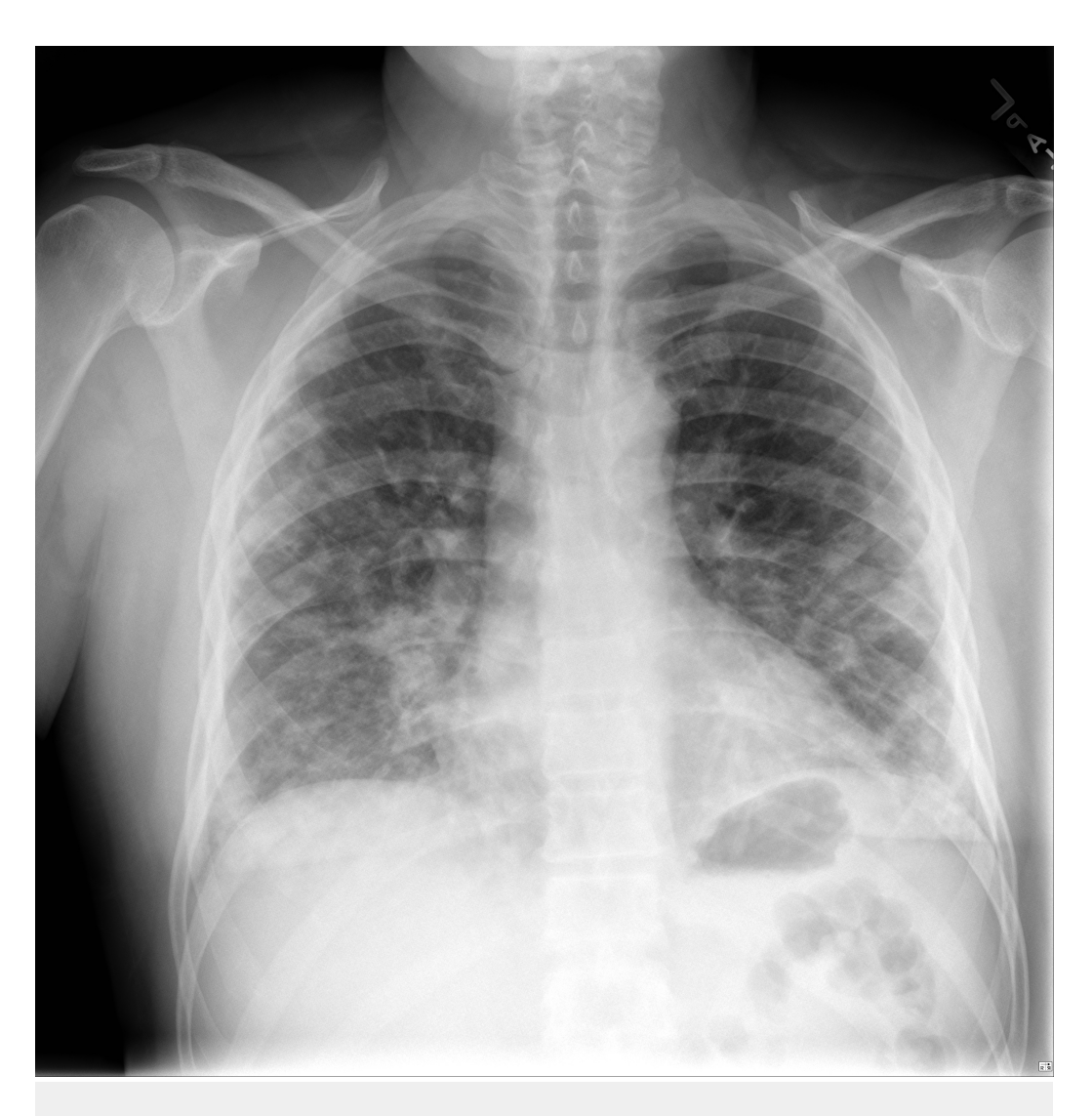
FIGURE 2: Chest X-ray (PA view): adjacent left basilar infiltrates and mild atelectasis. No infiltrates are seen on the right side