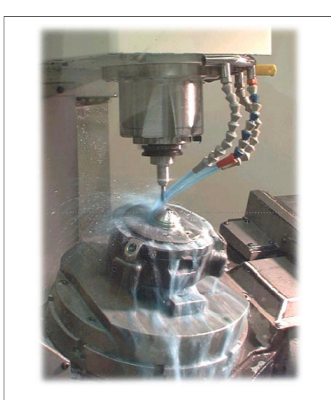
FIGURE 2 | Coolant applied during machining finishing of the cup after porous coating.

bacteria, were already considered before the recall as a possible cause for the adverse tissue reaction. Endotoxin tests on finished off-the-shelf cups, however, were all negative.