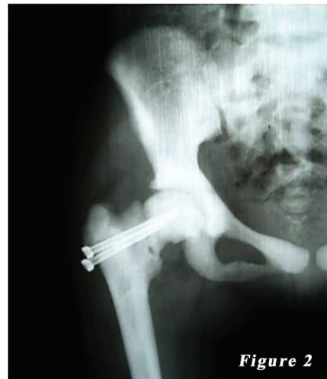
FIGURE 2: Postoperative radiography of the first patient.