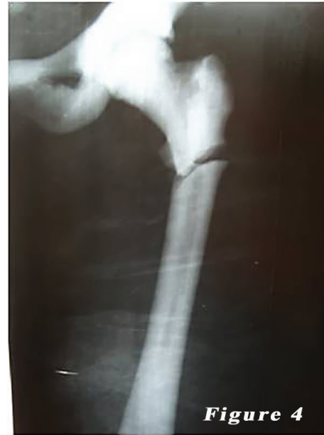
FIGURE 4: 24-year-old female patient (second case) preoperative radiograph of the left femur subtrochanteric fractures.

Osteopetrosis, which is a group of conditions, is a heterogeneous hereditary disease characterized by significantly increased bone density due to osteoclast dysfunction. Most patients with infantile or malignant autosomal recessive osteopetrosis die within the first year of life. The life expectancy of patients with intermediate osteopetrosis is moderately reduced, whereas adult patients with benign ADO have a normal life expectancy [10, 13]. Adult benign ADO has two distinct phenotypic variants [1, 5, 8–10, 13]: (i) type I, which is characterized by diffuse sclerosis, predominantly involving long bones, the skull base, and spine, and (ii) type II, which is characterized by radiographic findings of “rugger jersey spine” and “bone within a bone” appearance of the pelvis, in particular. There is no significant difference in radiographic findings of long bones of the appendicular skeleton between these types. Radiographic images contain heterogeneity in both types [1, 5–8, 14, 15]. Serum levels of alkaline phosphatase are reduced in type I and increased in type II. In addition, type I does not present with increased risk of fracture; however, fractures may develop, particularly in long bones, after even minor trauma injuries. Although