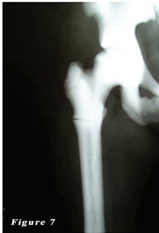
FIGURE 7: 24-year-old female patient (second case) preoperative radiograph of the right femur subtrochanteric stress fractures.

fracture (40%). The disease usually presents without bone marrow involvement. Laboratory values are usually within normal limits. But may be moderate anemia and mild increased serum levels of alkaline phosphatase. Family history or patient history may reveal previous fractures. The most common complaints on admission are bone pain and fractures. In adult benign ADO, bones are prone to fractures due to increased bone density and sclerosis with an increased rate of hip and proximal femoral fractures in type II [4, 5, 10–12, 14–18]. In a study including 42 patients with osteopetrosis tarda, Bénichou et al. [19] reported a fracture rate of 78%. The mean number of fractures was 4.4 and the most common fracture localization was the femur.