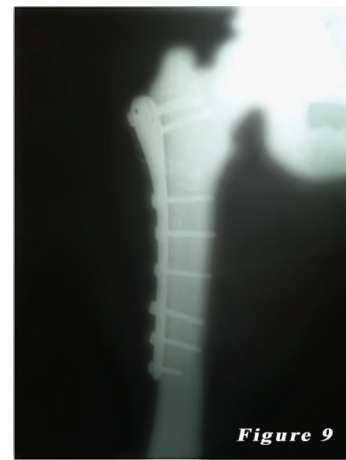
FIGURE 9: Her last right femur radiography. It looks like fracture union.

In our study, the first case had a positive family history, mild anemia, bilateral loss of vision, diffuse sclerosis, and an osteopetrotic fracture of the right femur. Despite generalized osteosclerosis and osteopetrotic pathological femoral fractures in the second case, her family history was indefinite. She had no neurological deficit and laboratory test results were within normal limits. None of the patients had a previous history of fractures. We diagnosed our patients with ADO type II based on the clinical findings and laboratory and imaging test results.