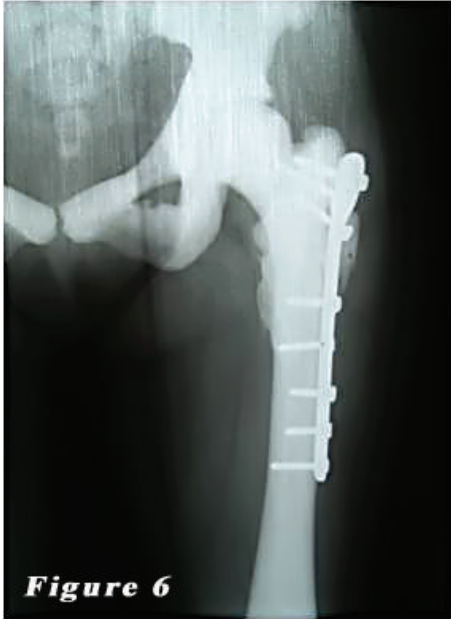
FIGURE 6: Her last left femur radiography. It looks like fracture union.