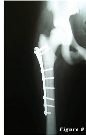
FIGURE 8: Postoperative right femur radiograph of the second patient.

fracture (40%). The disease usually presents without bone marrow involvement. Laboratory values are usually within normal limits. But may be moderate anemia and mild increased serum levels of alkaline phosphatase. Family history or patient history may reveal previous fractures. The most common complaints on admission are bone pain and fractures. In adult benign ADO, bones are prone to fractures due to increased bone density and sclerosis with an increased rate of hip and proximal femoral fractures in type II [4, 5, 10–12, 14–18]. In a study including 42 patients with osteopetrosis tarda, Bénichou et al. [19] reported a fracture rate of 78%. The mean number of fractures was 4.4 and the most common fracture localization was the femur.