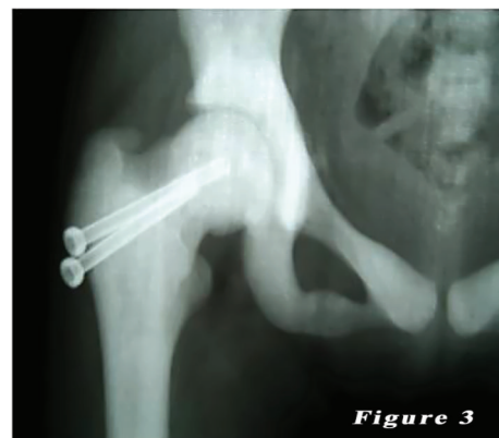
FIGURE 3: Her last radiography. It looks like fracture union.