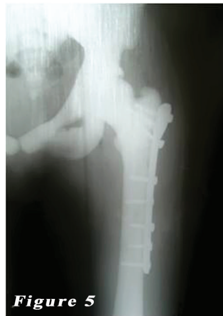
FIGURE 5: Postoperative left femur radiograph of the second patient.

rare in type I, the incidence of trigeminal neuralgia, facial nerve paralysis, and optic nerve compression is higher in type II. Also, short stature may result from diminished longitudinal growth in patients with type II disease. Other conditions which may be accompanied by ADO type II include hepatosplenomegaly, anemia, renal tubular acidosis, and pancytopenia [14–18].