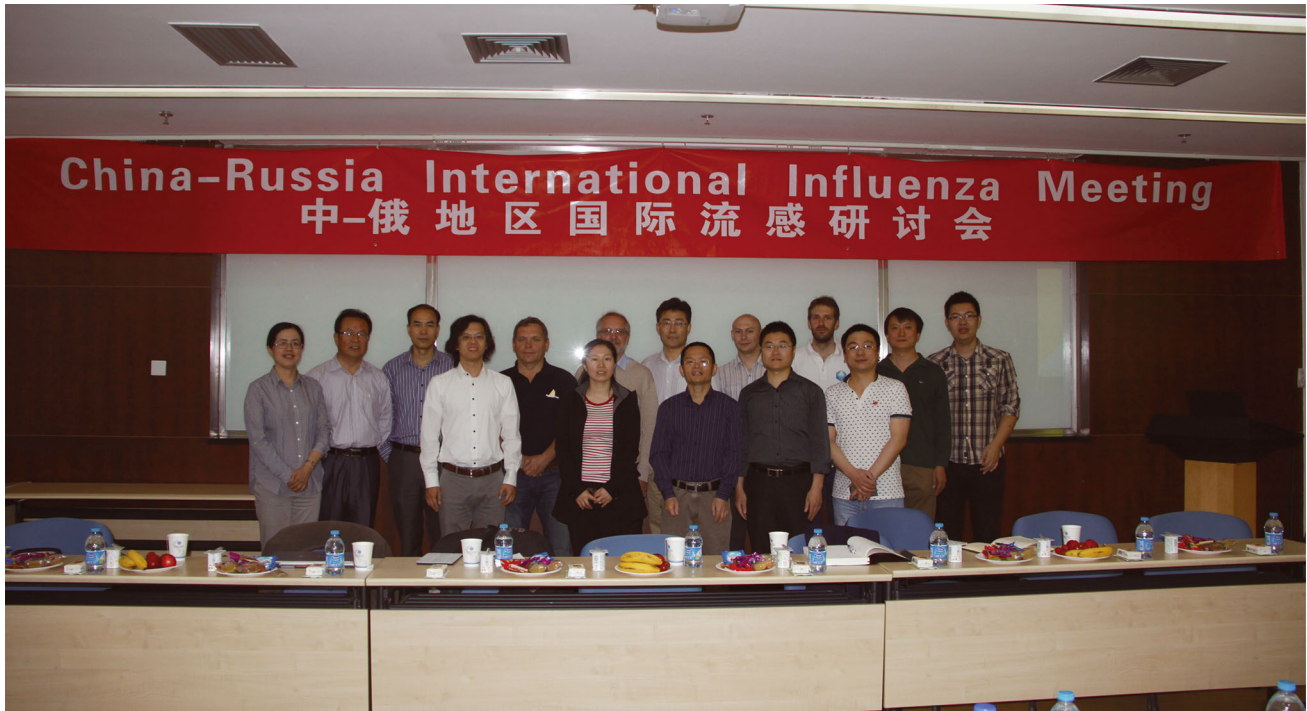
Figure 1. A joint meeting between China and Russia on influenza research held at the Institute of Microbiology, Chinese Academy of Sciences in Beijing in 2014.