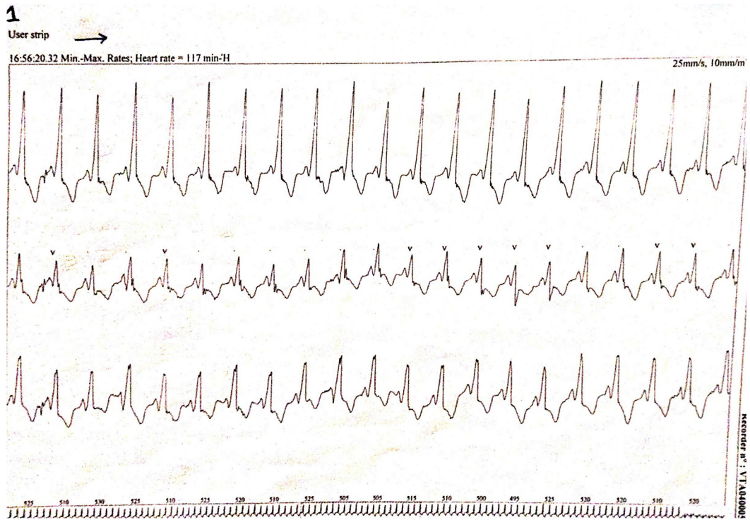
Figure 4 Electrocardiogram of the patient with Wolff-Parkinson-White syndrome.