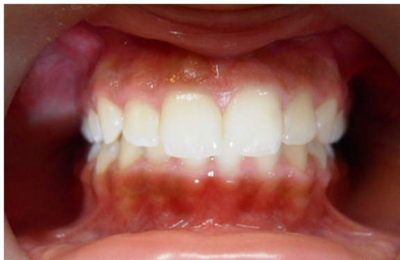
Figure 1 Frontal intraoral photo.

If more invasive treatments are needed in the future, they will be performed under antibiotic therapy and in collaboration with the cardiologist.