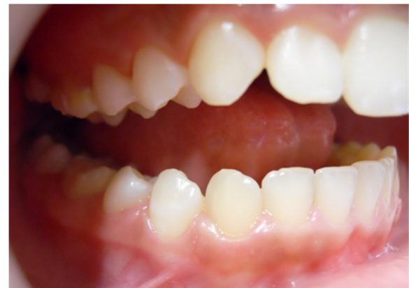
Figure 2 Buccal intraoral right photo.