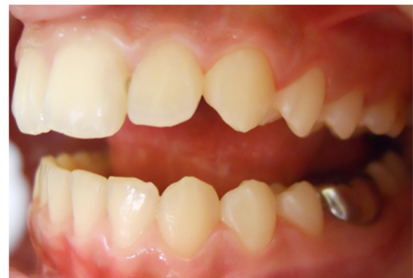
Figure 3 Buccal intraoral left photo.

The aim of this case report is to show how to maintain the correct oral health in a child with WPWS. There is no evidence of this problem in the scientific literature. The paroxysmal ventricular tachycardia can have different ways of presentation: WPWS is one of these. However, it is scientifically clear that the WPWS causes tachycardia, due to the disturbance of cardiac conduction. Tachycardia is an alteration of the autonomic nervous system (an increased tone of the sympathetic nervous system) [9]. The differential diagnosis with other diseases is more important. The ECG findings in people with the WPWS pattern can be similar to ECG findings seen in other cardiac conditions: myocardial infarction, ventricular premature beats or idioventricular rhythm, bundle branch block. Finally, some cases of hypertrophic cardiomyopathy may mimic WPWS [10]. Nowadays, one of the purposes to be achieved, by dentists and hygienists, is to keep the patient as relaxed as possible, explaining the procedures that will be performed each time to avoid unnecessary fears that can speed up the heartbeat. Several other issues are also discussed, such as the importance of continual