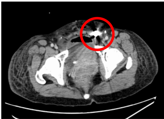
FIGURE 2 Postoperative computed tomography image at the time of caesarean section showing the details and location of the abnormal shadows in the pelvis which have the same density as metals

Only after using a metal detector to confirm that no metal components were present in pelvis, we performed MRI on POD 10 (Figure 3). The lesion was hyperintense on T1- and T2-weighted images and hypointense on fat suppression imaging, strongly indicating the possibility of a retained HSG contrast medium. The patient's postoperative course was uneventful, and she was discharged on POD 15. No complications occurred after hospital discharge, and we continued to perform pelvic radiography monthly to evaluate the details and shape of the contrast medium residue. However, due to the distance from her residence to our hospital, the patient requested