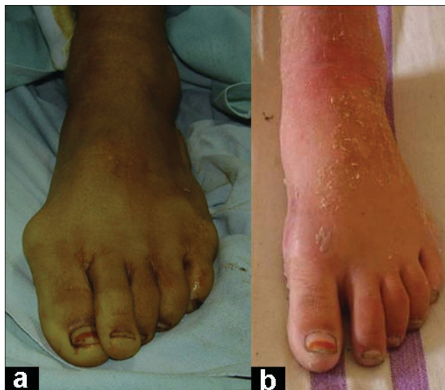
Figure 1: Clinical photograph (a) of left foot shows hallux valgus deformity, (b) Clinical photograph of the same patient shows correction achieved.

of callosities, overlapping the second toe and other abnormalities in the forefoot. The patients were questioned about pain, cosmesis, and shoe-wear problems. Weight-bearing anteroposterior (AP) and lateral radiographs were recorded in all patients. Hallux valgus angle (angle subtended by lines bisecting the long axis of the first metatarsal and proximal phalanx), intermetatarsal angle (angle subtended by lines bisecting the longitudinal axis of the first and second metatarsals), first metatarsal length, and osteoarthritic changes were noted. After surgery, the patients were regularly followed up for a period ranging from 18 months to 6 years, the average follow-up being three years. The patients, on each follow-up, were questioned about the cosmetic appearance of foot, pain over the metatarsal head, shoe-wear problems, and shoe-wear modifications. Thorough clinical examination was done, looking for appearance, calluses under second and third metatarsal heads (transfer lesions), sensory abnormalities, and the range of motion of first MTP joint. Standing AP and lateral radiographs were studied for hallux valgus angle, intermetatarsal angle, osteoarthritic changes, and metatarsal shortening. Broughton and Winson scoring system 10 as modified by Kartaglis 11 was used to assess the final results [Table 1]. The result was regarded as excellent when the patient achieved Grade 1 in all categories, good when the patient had no more