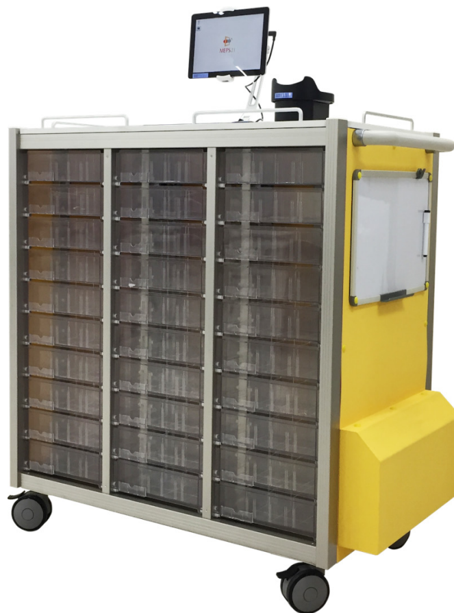
Figure 2 The photograph of the new cart.

The aim of this study was to evaluate the efficacy of a medication cart equipped with a palm vein authentication system for reducing drug administration errors in psychiatric hospitals.