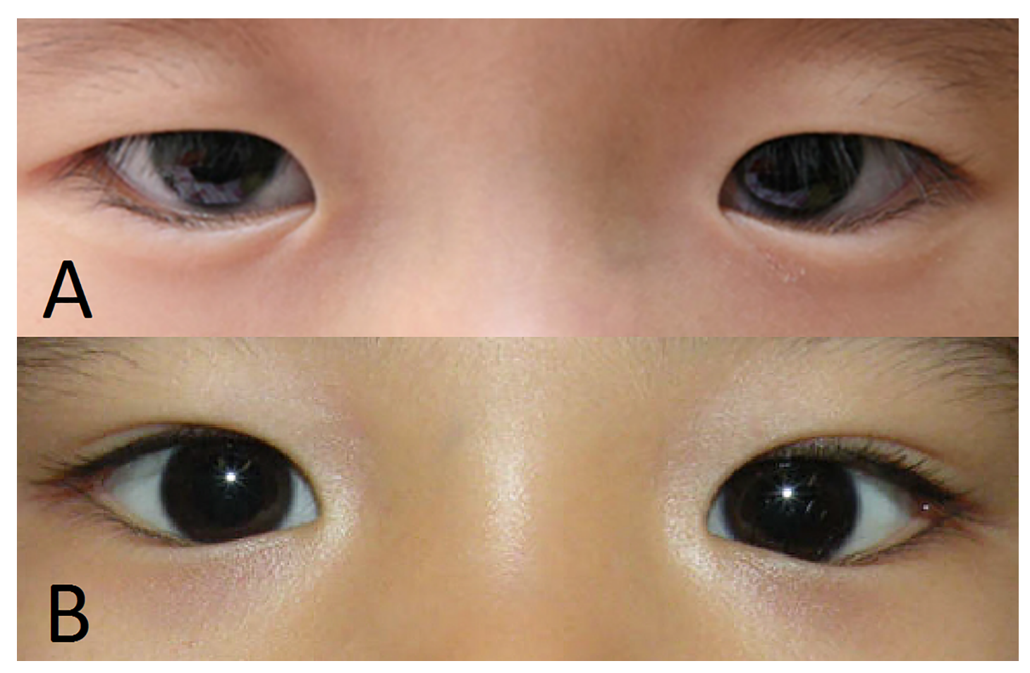
Fig 2. Types of epicanthus. (A) In type 1, a skin fold from the upper eyelid covers the medial canthal angle as it approaches the lower eyelid, creating a crescent-shaped fold onto the lower eyelid. (B) In type 2, a skin fold curves over the medial canthal angle and forms a confluent fold with the lower eyelid at the interpalpebral region.

https://doi.org/10.1371/journal.pone.0187690.g002