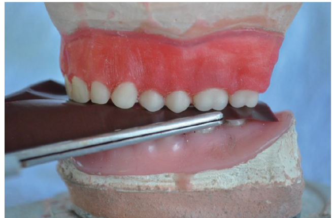
Fig. 3. Standardization of the contact points.

The first measurement of the OVD (Fig. 2) was performed using a digital caliper (Starret, São Paulo, SP, Brazil) to measure the distance between the maxillary and mandibular elements for each pair of complete-arch prostheses (the same mandibular complete-arch prosthesis was used in all groups). The distance was measured three times and the mean was recorded. The occlusal contacts in maximum intercuspation (MI) were also performed using SAA and an articulation paper (Accufilm, Parkell, Inc. Edgewood, NY, USA) between maxillary and mandibular arches. For standardization of the contact point images, the model was placed on a stone base fixed with double adhesive tape (3M, St. Paul, MN, USA) to guarantee the same position for all device models/prostheses (Fig. 3). After marking the occlusal contact points, the superior prosthesis was placed on a stone cast to record the images with a Digital DSLR camera (D90, Nikon, Tokyo, Japan) coupled to a 18 - 55 mm focal length lens (AF-S DX Zoom-Nikkor 18 - 55 mm f/3.5 - 5.6 G, Nikon). The captured images were analyzed in the IpWin 32 software (Fig. 4). The marks of the occlusal contact points on artificial teeth were removed with cotton soaked in ethyl alcohol.