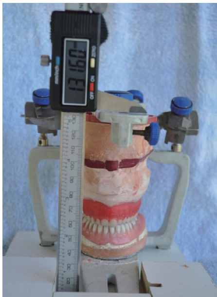
Fig. 2. Method used for measurement of alterations in occlusal vertical dimension: a digital caliper was used to measure the distance between the upper and lower frame of SAA before and after polymerization.

The first measurement of the OVD (Fig. 2) was performed using a digital caliper (Starret, São Paulo, SP, Brazil) to measure the distance between the maxillary and mandibular elements for each pair of complete-arch prostheses (the same mandibular complete-arch prosthesis was used in all groups). The distance was measured three times and the mean was recorded. The occlusal contacts in maximum intercuspation (MI) were also performed using SAA and an articulation paper (Accufilm, Parkell, Inc. Edgewood, NY, USA) between maxillary and mandibular arches. For standardization of the contact point images, the model was placed on a stone base fixed with double adhesive tape (3M, St. Paul, MN, USA) to guarantee the same position for all device models/prostheses (Fig. 3). After marking the occlusal contact points, the superior prosthesis was placed on a stone cast to record the images with a Digital DSLR camera (D90, Nikon, Tokyo, Japan) coupled to a 18 - 55 mm focal length lens (AF-S DX Zoom-Nikkor 18 - 55 mm f/3.5 - 5.6 G, Nikon). The captured images were analyzed in the IpWin 32 software (Fig. 4). The marks of the occlusal contact points on artificial teeth were removed with cotton soaked in ethyl alcohol.