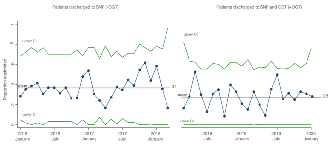
Figure 2 A statistical process control chart of monthly readmission rates during the study period among patients discharged to skilled nursing facility and OGT compared with patients discharged to skilled nursing facility only. OGT, outgoing geriatric team; SNF, skilled nursing facility.