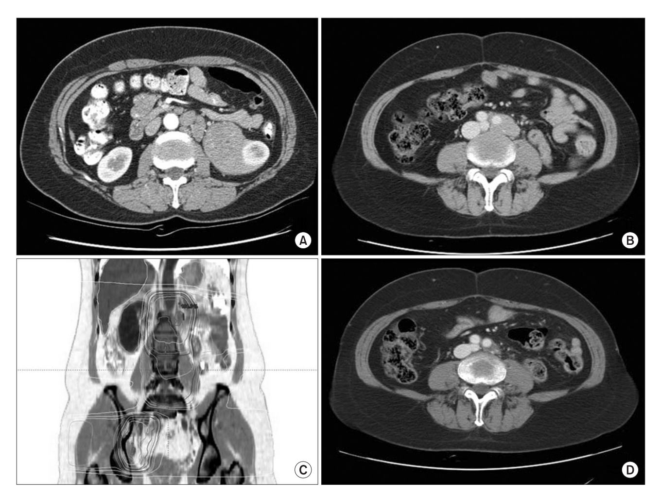
Fig. 2. Case 2. (A) Initial abdomen computed tomography scan, (B) recurrent para-aortic lymphadenopathy, (C) radiation therapy planning, and (D) partial response to radiation therapy.

The patient was a 51-year-old woman who had huge mass in left perirenal space. She took a medical examination because of easy fatigability and headache. On CT scan, there was about 13 cm sized mass originated from left perirenal space with diffusely conglomerated multiple lymphadenopathy in left para-aortic space (Fig. 2A). Chest X-ray, bone scan, laboratory test such as CBC and chemistry did not show any abnormal findings. On ultrasonograpy, perirenal mass had few vascularity in it and seated in hilum of left kidney. In addition, about 2 cm sized multiple lymphadenopathy were seen around abdominal aorta. Ultrasonography-guided biopsy of perirenal mass revealed polymorphorous lymphoid proliferation with stromal hyalinization. Proliferated cells consisted with small B