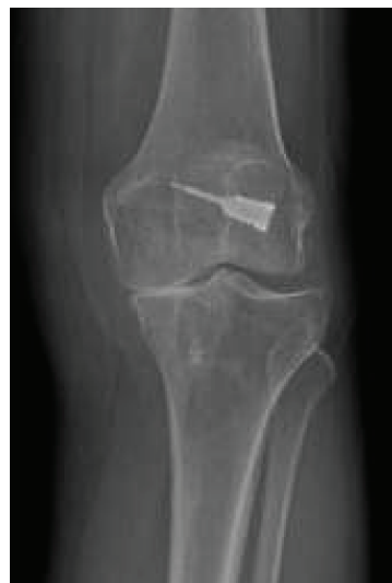
FIGURE 2: Left knee with significant medial compartmental osteoarthritis and evidence of a previous bone mulch ACL screw.

The patient was positioned supine; standard incision with a medial parapatellar arthrotomy was performed. A measured resection technique was then performed with an intramedullary guide placed in the femur. The femur was cut in 6 degrees of valgus and 3 degrees of external rotation. A size 4 femoral prosthesis was placed and noted to overhang both medially and laterally on the condyles. At this time, it was decided to downsize the femoral component. The 4 in 1 femoral cutting block was then placed back on the femur and was noted to be in contact with the bone mulch ACL screw. The bone mulch screw was located and identified in the lateral femoral condyle; a curette was used to clear the head of the screw, and it was removed. The proximal tibia was then prepared using an intramedullary guide with 3 degrees of posterior slope. A size 3 tibial component and a 9 mm poly were placed; the knee was noted to be tight in both flexion and extension. An additional 2 mm resection was performed on the proximal tibia. It was noted at this time while trying to trial the prostheses that the lateral femoral condyle was fractured. Conversion to a stemmed femoral component