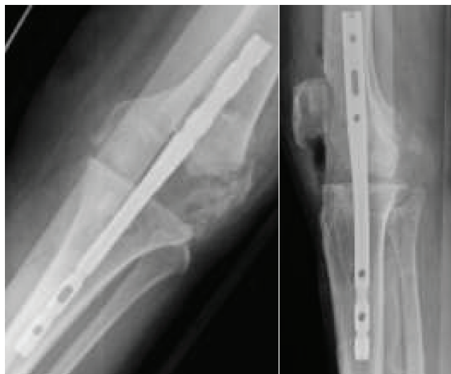
FIGURE 3: Intraoperative periprosthetic fracture fixated with an intramedullary nail.

with a cruciate stabilizing prosthesis was attempted. The femoral canal was reamed, and the femoral box cut was made. However, during trialing, the medial femoral condyle was now noted to have a fracture as well. An intraoperative consultation with an adult reconstruction trained orthopaedic surgeon was performed. Immediate surgical correction was not possible due to improper implants being presented. The femoral and tibial canals were then reamed to accept a 200 mm × 9 mm intramedullary nail to act as a temporary internal stabilization device (Figure 3). The knee was irrigated and closed, and the patient was admitted to the floor. The patient was then brought back to the OR on postoperative day 3 following the index procedure. The prior incision was utilized; the wound was copiously irrigated. It was noted that due to the patient's poor bone quality and comminution of the fractures that the only viable option was a