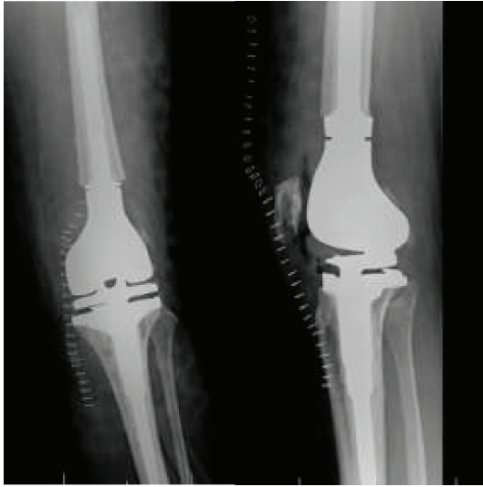
FIGURE 4: Immediate postoperative radiographs following hinged distal femoral replacement.

distal femoral replacement. The distal femur was resected, the femoral canal was reamed, and a planar was used on the distal femur. A skim cut and reaming of the tibia were performed. The components were trialed. Final implants included a 13 \times 127 mm hinged femoral prosthesis and small 1-stemmed tibial tray; a 32 mm patellar component was used, and a size 10 polyethylene was then inserted; all components were cemented. The knee was noted to be stable throughout range of motion with good patellofemoral tracking. The surgical wound was copiously irrigated and closed (Figure 4). Estimated blood loss was 100 mL; no postoperative transfusion was necessary. She was able to bear weight as tolerated immediately postoperatively. The patient's pain was controlled postoperatively, and she worked well with physical therapy and was discharged home with home health care on postoperative day two with 3 weeks of Coumadin for venous thromboembolism prophylaxis.