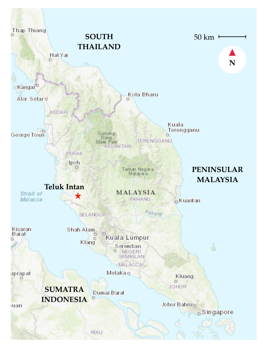
Figure 1. Map of Peninsular Malaysia showing the location of Teluk Intan (red star) within the State of Perak. Accessed on 13 May 2019 from https://landsatlook.usgs.gov/viewer.html.

Analyzer, Beckman Coulter, CA, USA). Assessed biomarkers included C-reactive proteins (CRP) (Immune Quantitative Analyzer) and procalcitonin (PCT) (Procalcitonin Rapid Test Kit, Easy Diagnosis Biomedicine Co., Ltd., Wuhan, China).