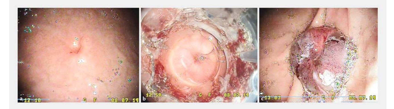
Fig.2 Persistence of gastrocutaneous fistula after percutaneous endoscopic gastrostomy removal ( a ). The gastric wall is going to be aspirated within the cap ( b ). The deployed Padlock Clip entraps the gastric wall and closes the fistula ( c ).

The characteristics of the eight patients with fistulas, perforations, or post-polypectomy bleeding are summarized in Table 1 . Indications for clipping were closure of gastrointestinal fistulas (n=4), management of iatrogenic gastrointestinal perforations (n=2), or hemostasis of post-polypectomy bleeding (n=2). Three clips were applied in the upper gastrointestinal tract (stomach and duodenum) and five clips in the lower gastrointestinal tract (rectum and sigmoid colon). In one patient, the delivery system failed to release the clip into the duodenum and the wall defect was closed with two through-thescope (TTS) clips. Clinical success (healing of defect or resolution of bleeding) was achieved in all patients. In three patients, clinical follow-up required re-endoscopy and no clip retention