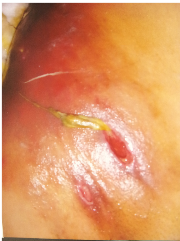
Fig. 1 Showing multiple fistula over right inguinal region with one sinus with faecal discharge

Richter's hernia occurs in small hernia rings large enough to entrap the partial circumference of the bowel wall, but small enough to prevent protrusion of a loop of the intestine, with firm margins commonly occurring in the femoral ring (72 %-88 %), followed by inguinal canal (12-24 %) and the abdominal wall incisional hernias (4 %-25 %). Recently