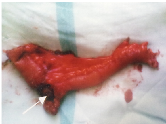
Fig. 3 Resected segment of the involved ileum with arrow showing the perforation

several cases have been reported at laparoscopic port insertion sites also [3]. Unusual occurrences occur at the insertion site of the drainage tube following open abdominal surgery, as a Spigelian's hernia, through the sacral foramen [1]. A Richter's hernia progresses more rapidly to gangrene due to constricting ring that exerts direct pressure on the bowel wall and hence compromised blood supply. When less than two thirds of the circumference of the bowel wall is involved, the signs and symptoms of intestinal obstruction are absent. This leads to late diagnosis or even misdiagnosis, and thus it allows bowel necrosis to develop [1].