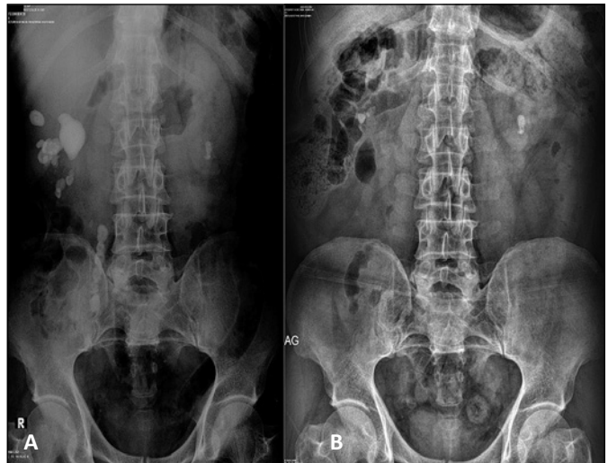
Figure 1A. Preoperative KUB X-Ray of the patient have massive pelvicalyceal stone burden with steinstrasse at the right ureter. B. After postoperative first year KUB X-Ray of the same patient after right open pyelolithotomy and nephrolithotomy with ureterolithotomy.

Stone analyses were obtained from 15 patients during the postoperative period and compared with previous stone analysis results when available. Eleven out of 18 patients had stone analysis preoperatively