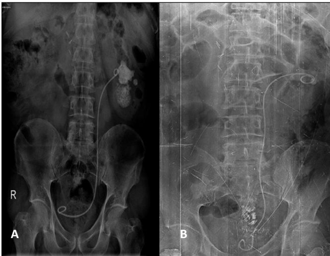
Figure 6A. Preoperative KUB X-Ray of the patient with a large renal pelvis stone and several small ones in the lower pole calyces. B. Postoperative KUB X-Ray of the same patient after open left stone removal showing minimally residual stone disease.

more experienced in open stone surgery compared with today's urologists. Buchholz et al. made an important review on the role of open stone surgery cases in surgical education. After discussing the important role of open surgery in the past and the shifting to endourologic or laparoscopic approaches in present practice, the authors underlined the inconvenience of introducing proficient open surgery training during the residency period. In this review, the authors have offered centralization to achieve a satisfactory case load in order to provide proper surgical training on open stone surgery [13]. Heers and Turney analyzed the Hospital Episode Statistics da-