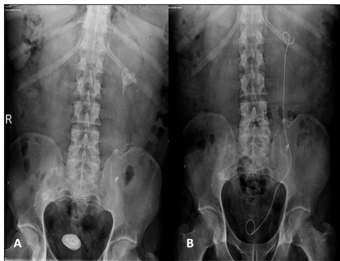
Figure 4A. Preoperative KUB X-Ray showing forgotten and broken DJ ureteral stent with bladder and kidney stone of the patient who had previous left URS history. The patient had administered to a foreign hospital and undergone an unsuccessful DJ catheter removal. B. Postoperative KUB X-Ray of the same patient after open cystolithotomy and left pyelolithotomy with DJ catheter removal.

which included 4 whewellite stones, 3 whewellite and weddellite stones and 4 cystine stones. Nine out of 18 patients had metabolic analysis preoperatively. None of the patients in our cohort had renal tubular acidosis. Five patients had enteric hyperoxaluria and 4 patients had hypercalciuria and hypocitraturia.