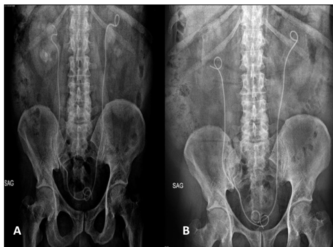
Figure 3A. Preoperative KUB X-Ray of the patient who had undergone emergency bilateral ureteral double pigtail stent placement due to acute renal failure in a foreign health center. B. Postoperative KUB X-Ray of the same patient after two consequent open pyelolithotomy sessions for left and right kidney stones.