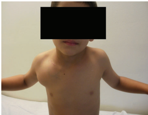
Figure 1: Lymph node conglomerate over the right axillary region.