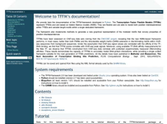
Figure 1. Screenshot of a new TFFM introduced in the new dedicated layout. Refer to (2) for details on TFFMs and interpretation of the dedicated logos describing the dinucleotide dependencies captured by the models.