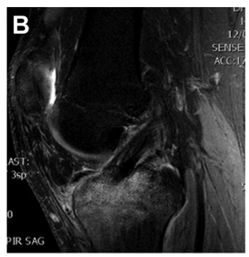
Figure 2. (A) Coronal and (B) sagittal plane T2-weighted magnetic resonance images for patient 1 indicating subtle changes adjacent to the interference screw and presenting an extensive hyperintense signal within the proximal tibia adjacent to the implant.