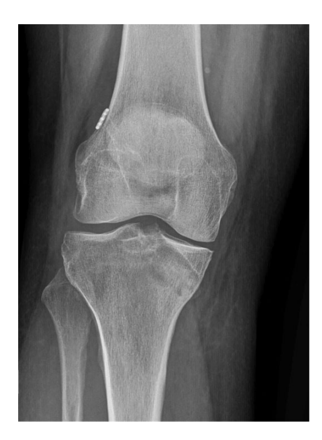
Figure 4. No significant abnormalities were detected on anteroposterior knee radiographs in patient 2. The interference screw is apparent with potential loosening but without significant bone resorption. Sclerotic changes are consistent with chronic remodelina.

After the procedure, the patient was started on intravenous daptomycin (500 mg every 24 hours) with the option of deescalation, and ceftriaxone (2 g every 24 hours) pending culture results. Despite results inconsistent with an active infection, ID recommended 6 weeks of antibiotic treatment as a cautionary measure. By 11 days postoperative, wounds were closed without signs of infection. Ultimately, treatment included 2 weeks of intravenous daptomycin followed by ceftriaxone for 4 weeks, and transition to oral doxycycline (100 mg every 12 hours) for 4 weeks. This course of antibiotics was shorter than the antibiotic regimen of patient 1. One year after treatment, the patient remains asymptomatic, without signs of infection.