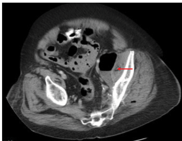
Figure 1 Initial CT-scan showing abscess with air–fluid level abutting left psoas muscle, indicated by red arrow.

On the fifth hospital day, the source of bacteremia was not identified and routine evaluations of the urinary tract and lungs failed to show evidence of infection. The patient had complaints of left flank pain; however, with improved leukocytosis and no other sources of infection, work-up was deferred. On the seventh hospital day, persistent abdominal pain prompted CT imaging of the abdomen, which revealed a 14 \times 3.7 \times 7.2 cm abscess along the medial wall of the left psoas muscle (Figure 1) and 2 additional abscesses at the L5–S1 level; 5.4 \times 3.6 cm in the midline and 3.4 \times 2.3 cm left of midline, and intramuscular air in the left gluteal muscles. The patient was diagnosed with Hinchey stage 3 complicated diverticulitis and the surgery service was consulted. A Hartmann's procedure and abdominal washout was performed, with intraoperative findings of purulent peritonitis.