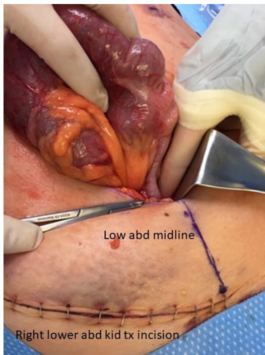
Figure 1 Intraoperative finding of cecal volvulus. Noted that the cecum rotated counterclockwise. The base of the appendix was pointing to the left lower quadrant of the abdomen. abd, abdomen; kid, kidney.

laparoscopy. Intraoperatively, it was converted to an open laparotomy because of unexpected finding of cecal volvulus (figure 1) with ischemia (figure 2).