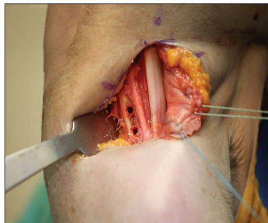
Figure 1: Pectoralis major tendon held with two #2 Fiber wire® (Arthrex, Inc., Naples, FL, USA) locked sutures in a Krackow fashion. The humeral insertion site was properly prepared, creating a trough with a rounded burr at the anatomic insertion site, lateral to the biceps tendon