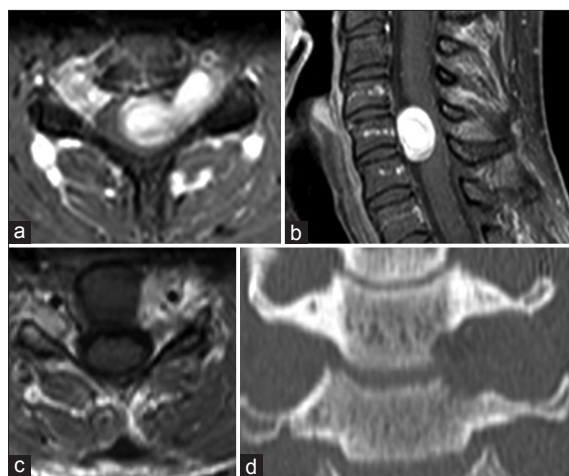
Figure 1 : Preoperative axial (a) and sagittal (b) MRI with contrast showing a predominantly intradural tumor component; postoperative MRI (c) (T1 with Gadolinium) showing a gross total resection through the expanded C5 foramen; coronal CT (d) showing the expanded C5 foramen (patient 1)

Following hospital ethics committee approval, a retrospective chart review was carried out. Between 2007 and 2013, 17 patients underwent retrojugular resection of laterally placed cervical spinal tumors. Among these were four “true” dumbbell tumors resected using a transforaminal retrojugular (TFR) approach. The lead surgeon was the same in all cases (JMD). Clinical and radiological presentation is outlined in Table 1. In all but one case [Figure 1], the extraspinal component was larger than the intraspinal component. The index neural foramen was expanded in all four patients [Table 1]. All patients were followed up clinically and radiologically [Table 2].