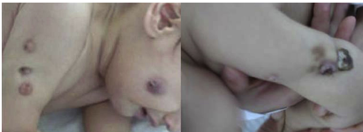
Figure 1 Violaceous, tender, superficially ulcerated plaques on right deltoid area, right cheek and right forearm.

granuloma'. Regarding the initial appearance of the lesions after BCG vaccination and histopathology, scrofuloderma was considered. However, acid-fast bacillus smears and initial cultures for nonspecific bacteria and mycobacteria were negative. The patient was empirically treated with isoniazid 5 mg/kg, rifampicin 10 mg/kg and pyrazinamide 25 mg/kg and skin lesions improved gradually.