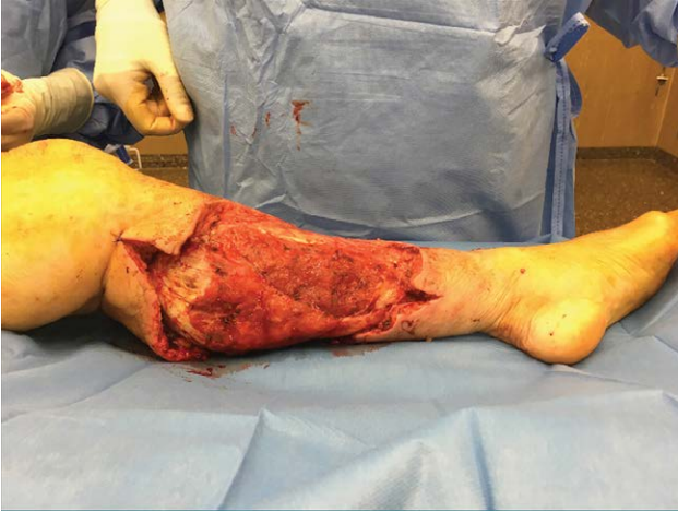
Fig. 5. Photograph of left lower leg defect after eight debridements, 6 weeks after initial presentation at regional hospital.