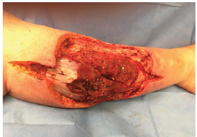
Fig. 4. Defect on left lower leg demonstrating necrosis (photographs taken on day 12, after debridement).

A registration of the protocol on the PROSPERO International Prospective Register of Systematic Reviews (CRD42021256711) was performed according to the guidelines described in the Preferred Reporting Items for