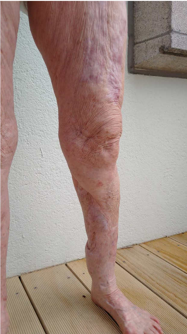
Fig. 6. Photograph taken 12 months postoperative of left lower leg, following a medial hemi soleus flap coverage (anterior view/left leg).