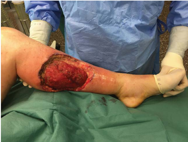
Fig. 2. Photograph showing the extent of the wound of the left lower leg defect (taken on day 8).

Fungal microscopy with periodic acid Schiff staining of the tissue samples showed aseptate fungal hyphae consistent with zygomycete infection. On day 14, fungal growth with filamentous fungi in the tissue samples confirmed an invasive mucormycosis and treatment with posaconazole 300 mg per 12 hours was started immediately. Due to the