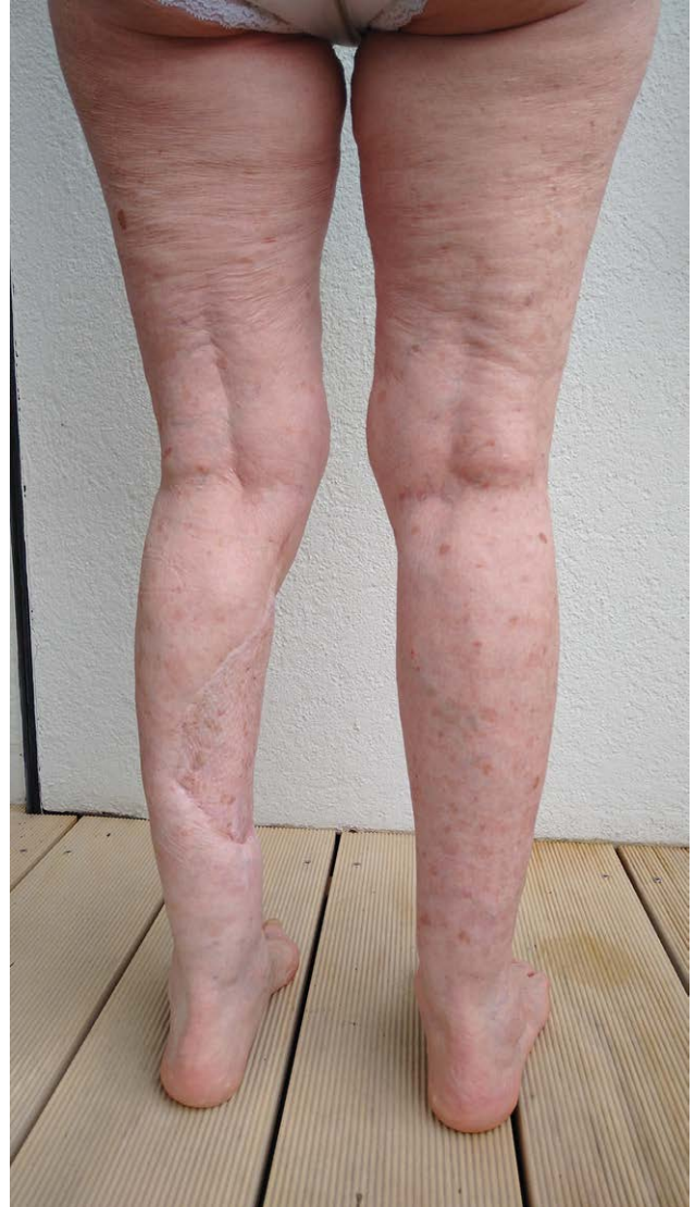
Fig. 7. Photograph taken 12 months postoperative of lower legs bilaterally, following a medial hemi soleus flap coverage (posterior view).

Systematic review and Meta-Analysis Protocols flow chart (Fig. 8).