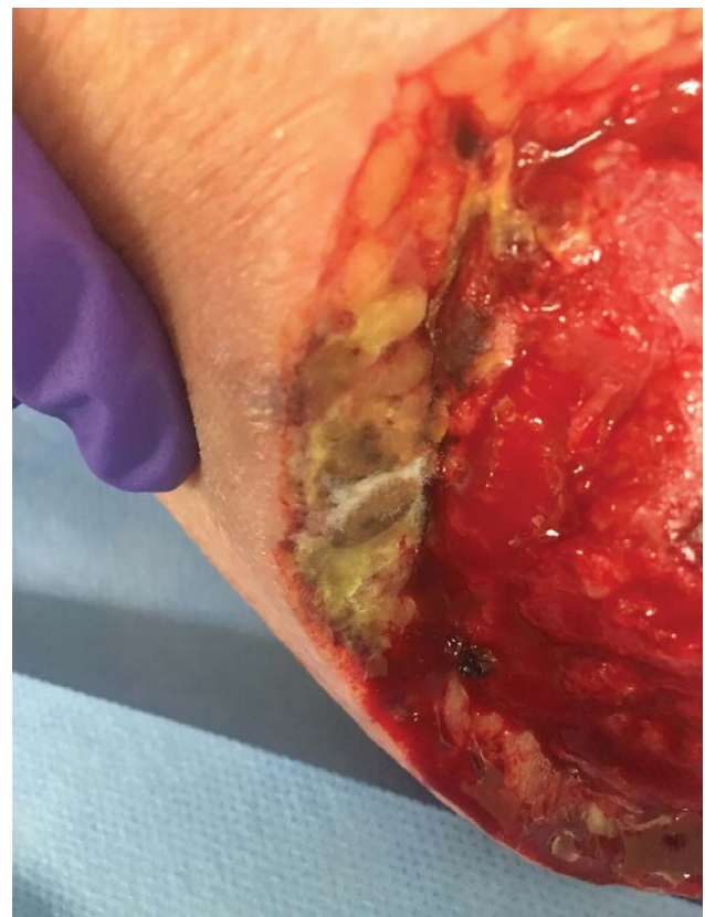
Fig. 1. Preoperative (magnified) view of the wound showing necrotizing panniculitis on the left lower leg (taken on day 8).

in the wound bed despite escalated antibiotic treatment. The patient presented with a defect of 400 cm 2 on her left lower leg (Fig. 3). The defect extended from the anterior aspect of the tibial bone medially toward the popliteal fossa proximally, exposing the soleus muscle and the medial head of the gastrocnemius muscle, 12 cm above the medial malleolus. Due to ongoing necrosis and an ambiguous diagnosis, another surgical debridement was performed (Fig. 4). Samples were sent for microbiological investigations; the wound was covered with a vacuum-assisted closure system.