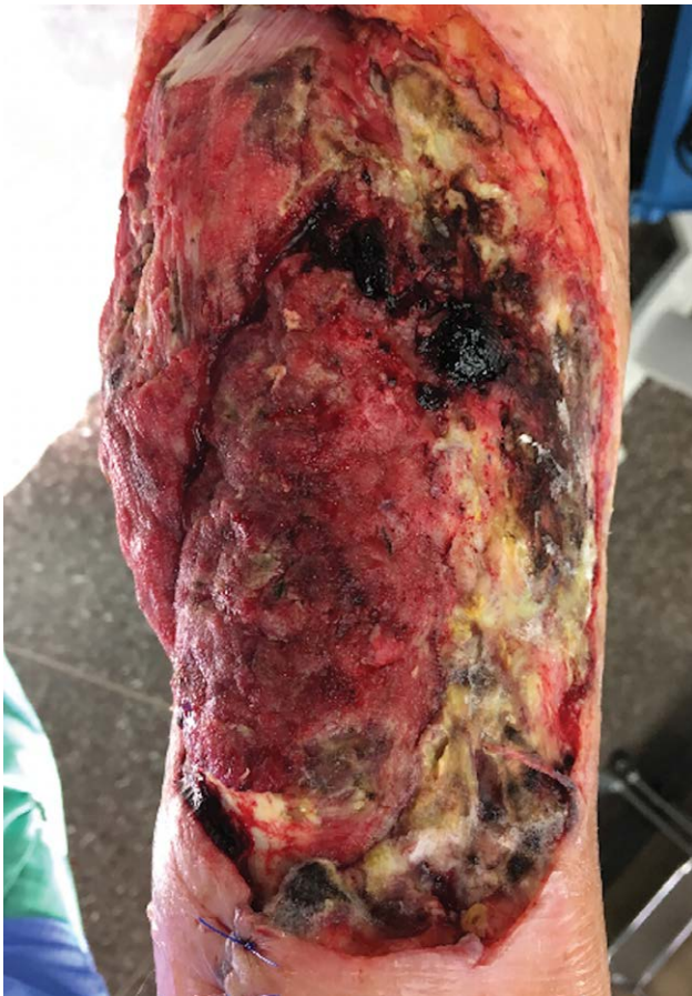
Fig. 3. Defect on left lower leg demonstrating necrosis (photographs taken on day 12, before debridement).

Fungal microscopy with periodic acid Schiff staining of the tissue samples showed aseptate fungal hyphae consistent with zygomycete infection. On day 14, fungal growth with filamentous fungi in the tissue samples confirmed an invasive mucormycosis and treatment with posaconazole 300 mg per 12 hours was started immediately. Due to the