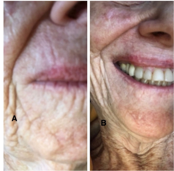
Fig. 4 Closer views of the upper lip—no smiling (a) and smiling (b)—show that the surgical site has healed nicely and that the scar is well placed among the other skin folds on the upper lip

Genomic analysis of basal cell carcinoma tumors has associated the cancer with an aberration of the Hedgehog pathway, with mutations affecting the PTCH1 ( patched 1 ) gene [2–5].