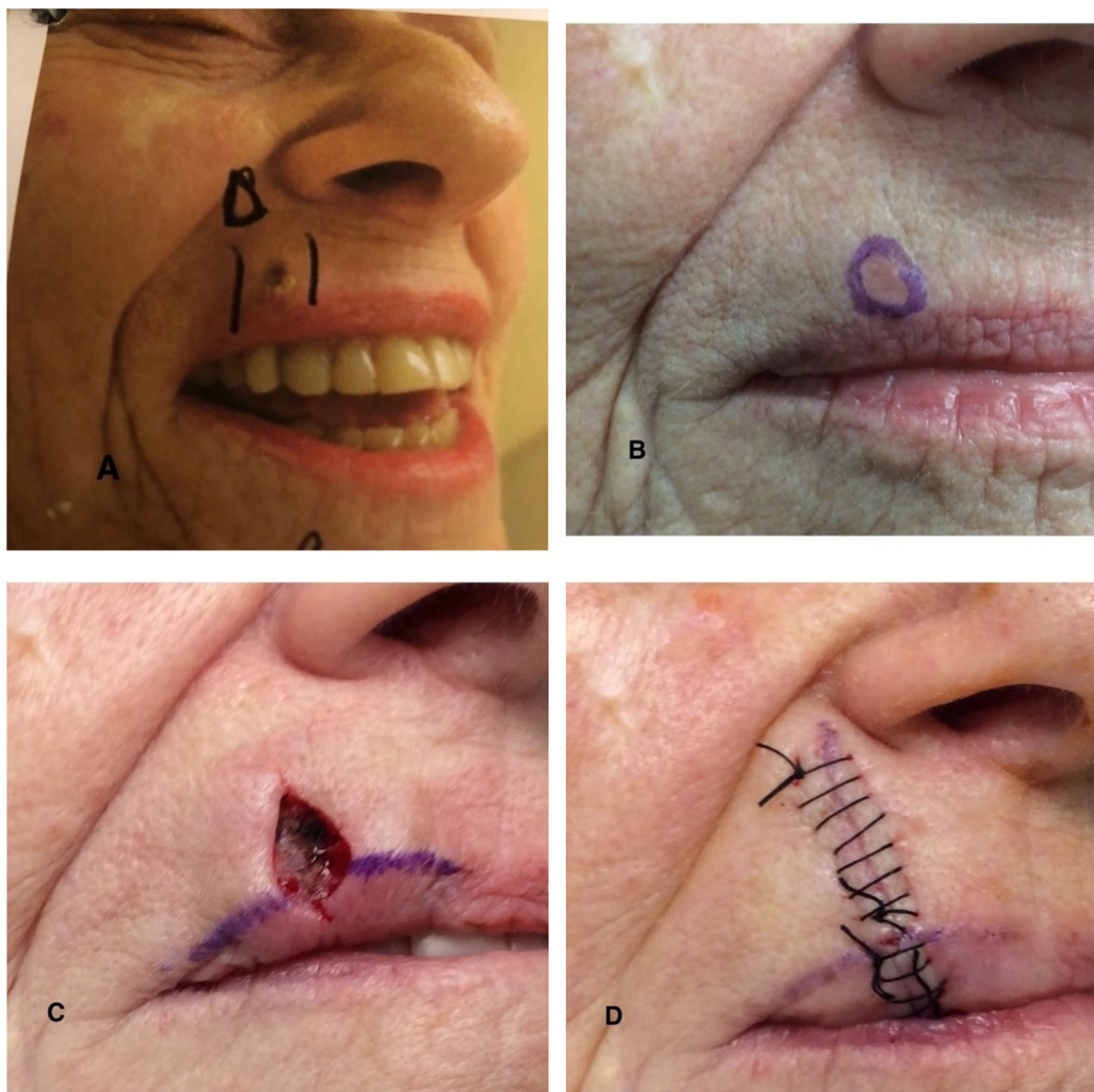
Fig. 1 a–d An 82-year-old woman developed a basal cell carcinoma on the right side of her upper lip. The upper lip, right side, was the site of the non-healing scratch. a Photograph of the site after a shave biopsy had been performed to determine the diagnosis of the persistent skin lesion (below the purple triangle and between the purple linear lines); the surface of the lesion has been cauterized. b The residual basal cell carcinoma, which is located at the

biopsy site (circled in purple ink), appears as a flesh-colored nodule. c Mohs surgery (with the tumor being cleared after taking one surgical stage) was performed to excise the skin cancer; purple ink (extending from the surgery-created tumor-free wound) marks the vermilion border between the cutaneous and mucosal upper lip. d The surgical wound was modified into an ellipse; the wound was subsequently sutured in a side-to-side manner