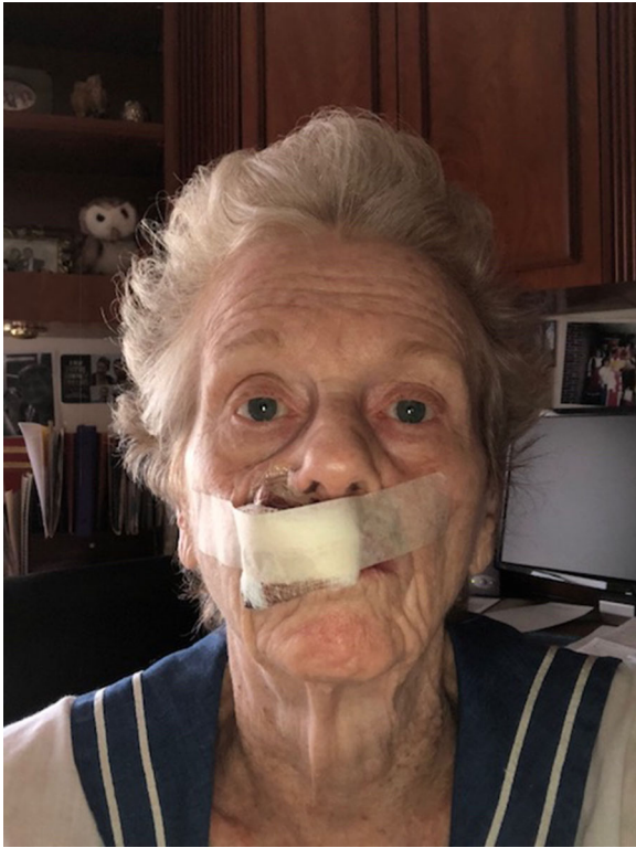
Fig. 2 Photograph of the patient taken postoperatively showing a bulky pressure dressing on her upper lip