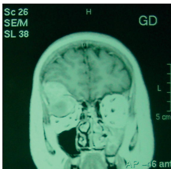
Figure 2. Coronal T1-weighted MRI with contrast, orbital roof destruction by the enhancing mass.

eye and downward deviation of the globe. Magnetic resonance imaging showed a well-defined extra-conal complex mass with hypo-intense on T-1 and hyper-intense on T-2 weighted images, with fluid-fluid levels (Figure 2).