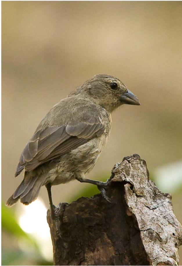
Figure 1. A mangrove finch, the rarest of Darwin's finches. The population of the Galapagos mangrove finch ( Camarhynchus heliobates ) has fallen to about 100 individuals, making it one of the world's most critically endangered birds. The species is now entirely confined to mangrove forests on the east and west coast of the island of Isabela. The main reasons for the decline in the mangrove finch are probably the impact of introduced pest species. The black rat ( Rattus rattus ) arrived in the Galápagos on pirate vessels perhaps as early as the 16th century, whereas feral cats ( Felis catus ), the smooth-billed ani ( Crotophaga ani ), two species of fire ants ( Wasmannia auropunctata and Solenopsis geminate ) and a parasitic fly ( Philornis downsi ) have been introduced by humans more recently. doi:10.1371/journal.pone.0011191.g001

speciation in the mangrove finch, we also studied morphological and genetic divergence between the two remnant populations.