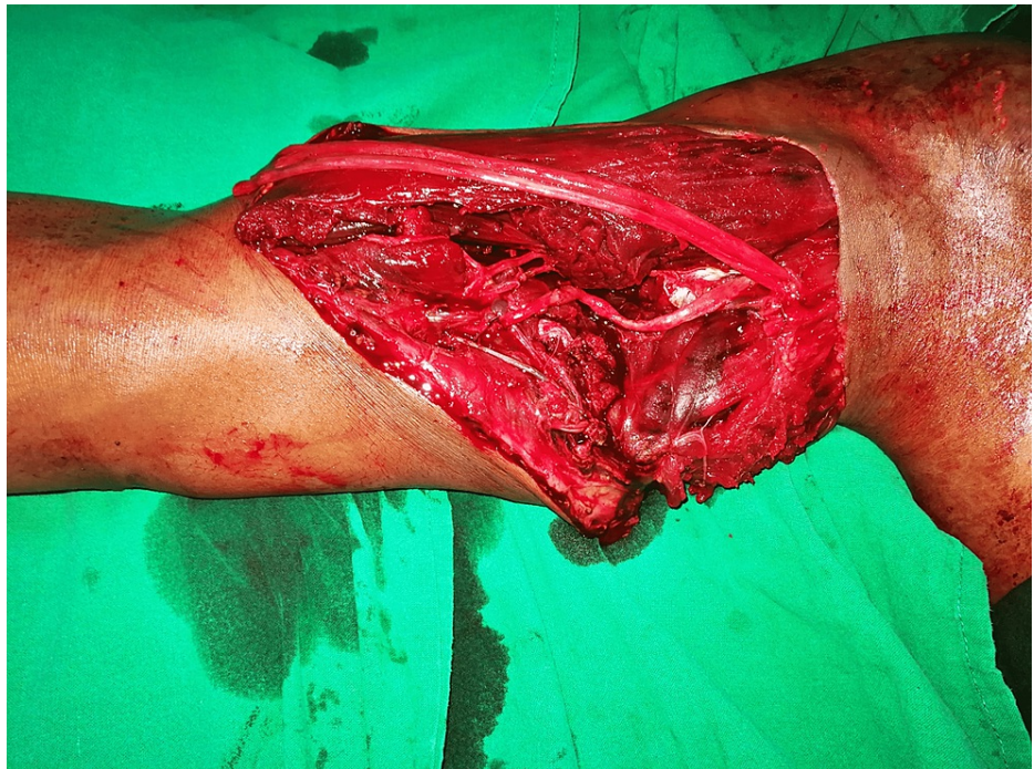
FIGURE 2: Post fracture fixation and reversed saphenous vein grafting. Avulsed median and ulnar nerves visible