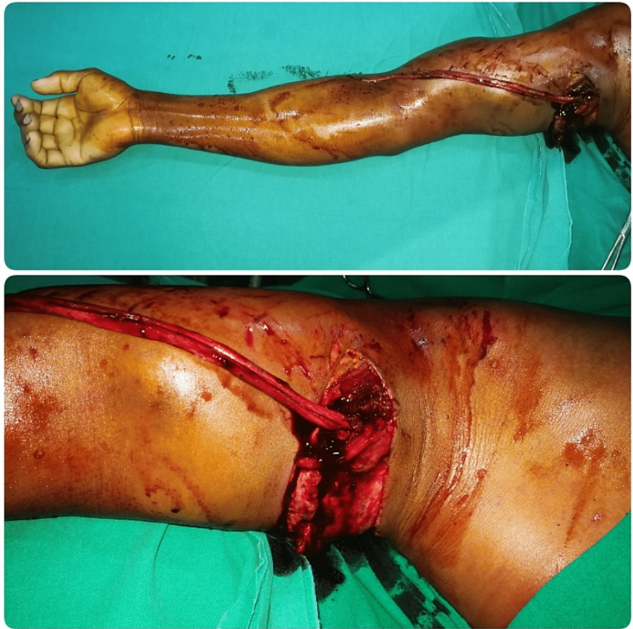
FIGURE 1: Near total amputation of the right arm – injury pictures