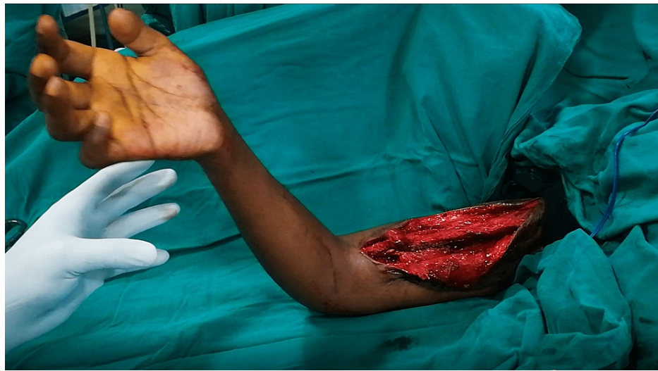
FIGURE 4: Intra-operative elbow flexion after wide-awake tenolysis