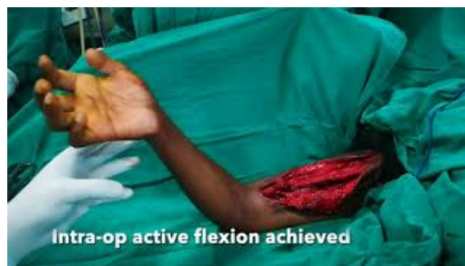
VIDEO 1: Perioperative video of the tenolysis

View video here: https://youtu.be/4-IJc4S8zgl