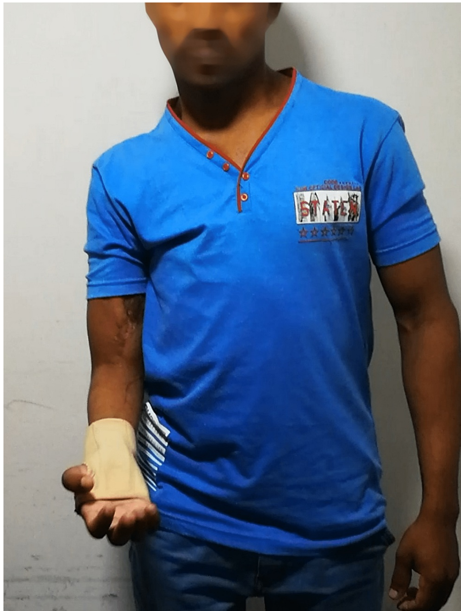
FIGURE 5: Follow-up at four months after release