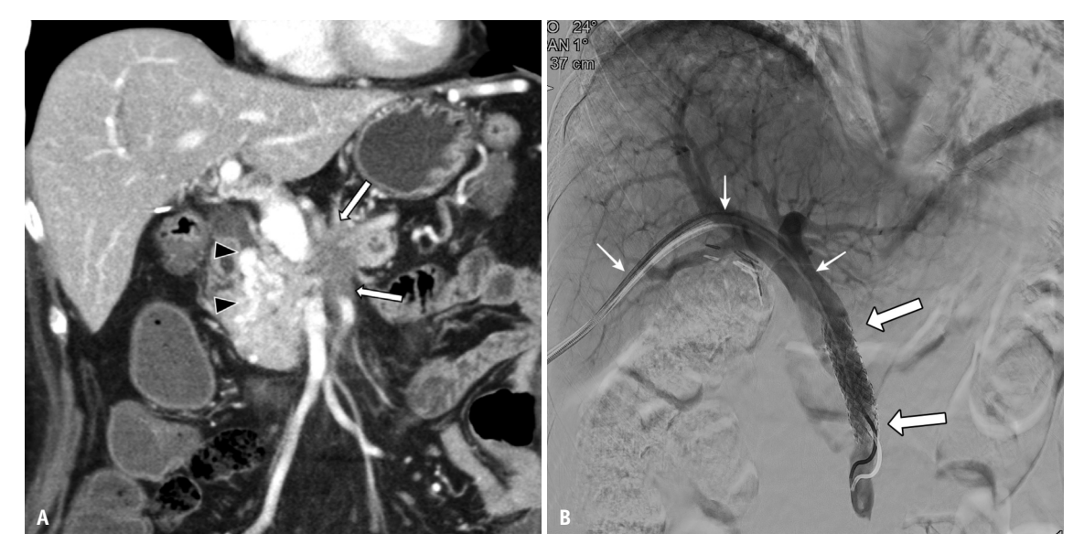
Fig. 2. A 68-year-old female with adenocarcinoma of the pancreas body with multiple liver metastases presented with portal vein stenosis.

A. Initial computed tomography showed mass in the pancreatic body (arrows) and near-total occlusion of the portal vein with cavernous transformation (arrowheads). B. After placement of a percutaneous transhepatic portal vein stent, transcatheter (thin arrows) portography showed good portal venous flow through the covered stent (thick arrows). The patient underwent FOLFIRINOX chemotherapy but died 20 months later.