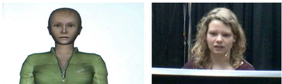
Fig 1. Virtual listener (left) interacting with human speaker (right) in the present experimental set-up (see also S2 Video).

Avatar characteristics and behaviors. The experiment was programmed using WorldViz's Vizard 5.5. Three different female avatars were created based on a stock avatar produced by WorldViz. The avatars' speech was pre-recorded by three different female native speakers of Dutch and played at relevant points during the experiment. The avatars' lip movements were programmed to match the amplitude of the pre-recorded speech files, creating the illusion of synchronization. The speech materials consisted of a general introduction (e.g., Hoi, Ik ben Julia, leuk je te ontmoeten! ; 'Hi, I'm Julia, nice to meet you!') and Ik heb een aantal vragen aan jou ; 'I have a couple of questions for you') and a set of 18 open-ended questions (e.g., Hoe was je weekend, wat heb je allemaal gedaan? ; 'How was your weekend, what did you do?'). The avatar also gave a response to the participant's answer (e.g., Oh ja, wat interessant! ; 'Oh, how interesting!') before proceeding to the next open question (e.g., Ik heb nog een vraag aan jou ; 'I have another question for you'), or to close the interaction ( Hartelijk bedankt voor dit gesprek, ik vond het gezellig! ; 'Thank you very much for this conversation, I enjoyed it!') (see S2 Video for an example of a trial). Whenever an avatar was in the listener role, her feedback responses—the crucial experimental manipulation in the present study—were modeled on typical feedback behavior that occurs in natural conversation. These behaviors consisted of