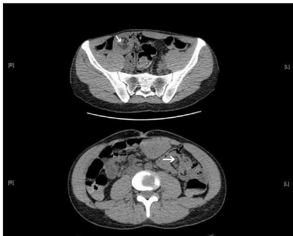
Figure 1 Axial computed tomography (CT) scan images demonstrating intussusceptions at different levels, with intussusciens ( single black arrow ), intussusceptum ( thick white arrow ) and vessels in the invaginated mesenteric fat ( thin white arrow ).

most patients presented with bleeding and intestinal intussusception [11,12]. To the best of our knowledge, in all those reports of patients with single or multiple enteric intussusception, abdominal signs and symptoms of some kind were present. This led the clinician to suspect the condition is a surgical emergency. Here we report a case of multiple small intestinal intussusception in a young adult man presented with melaena, but with a completely unremarkable abdominal examination.