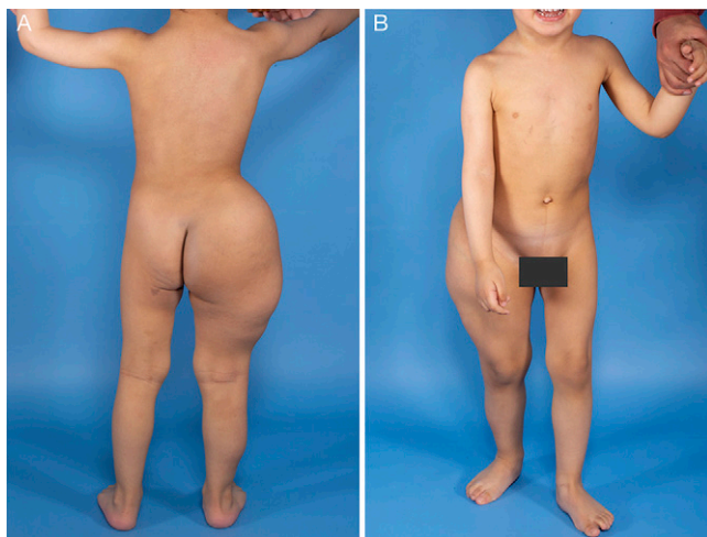
FIG. 1. Clinical images, posterior (A) and anterior (B) views, showing overgrowth of the proximal right lower extremity, most pronounced in the posterior and lateral aspects.

The patient was subsequently referred to the Mayo Clinic to be examined by our multidisciplinary team, which included a neurosurgeon, a neurologist, a plastic surgeon, an orthopedist, and a clinical geneticist. His physical examination was notable for overgrowth of his proximal right lower extremity (Fig. 1) and several café-au-lait spots without other cutaneous stigmata of NF1. Neurological evaluation was notable for decreased interest in daily activities; however, no neurological deficits were found. A differential diagnosis of PTEN hamartoma tumor syndrome was also suggested. Genetic testing of a blood sample for NF1 as well mutations in the PTEN gene was negative. Repeat MRI was performed, which revealed lipomatous overgrowth of the soft tissues of the right gluteal region, anterior, lateral, and posterior thigh, as well as fatty infiltration of the gluteal musculature and the tensor fasciae latae. There was a lipoma between the vastus lateralis of the quadriceps and its fascia, causing mass effect on the muscle. This lipoma was found to be contiguous with the lipomatous lesion centered within the gluteal region. The muscle itself was otherwise radiographically unremarkable (i.e., no overgrowth, lipomatous infiltration, or denervation changes). The patient also had a dumbbell-shaped lipoma extending from the