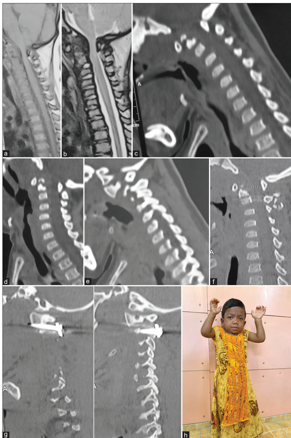
Figure 1: (a) T1-weighted magnetic resonance imaging showing hypoplastic odontoid process with ill-defined periodontoid tissue. (b) T2-weighted magnetic resonance imaging showing compression of neural structures at the craniocervical junction. (c) Computed tomography scan with the head in flexed position showing the hypoplastic odontoid process and atlantoaxial instability. (d) Computed tomography scan with the head in extended position showing “vertical reduction” of atlantoaxial instability. (e) Computed tomography scan with the cut passing through the facets showing Type 1 atlantoaxial facetal instability. (f) Postoperative computed tomography scan showing atlantoaxial fixation in aligned position. (g) Postoperative computed tomography scan showing the implant. (h) Follow up profile image of the patient (with permission)

patients had cervical canal stenosis and one of these patients had associated atlantoaxial instability. [4] The patients were treated essentially with only spinal decompression with an additional spinal fusion.