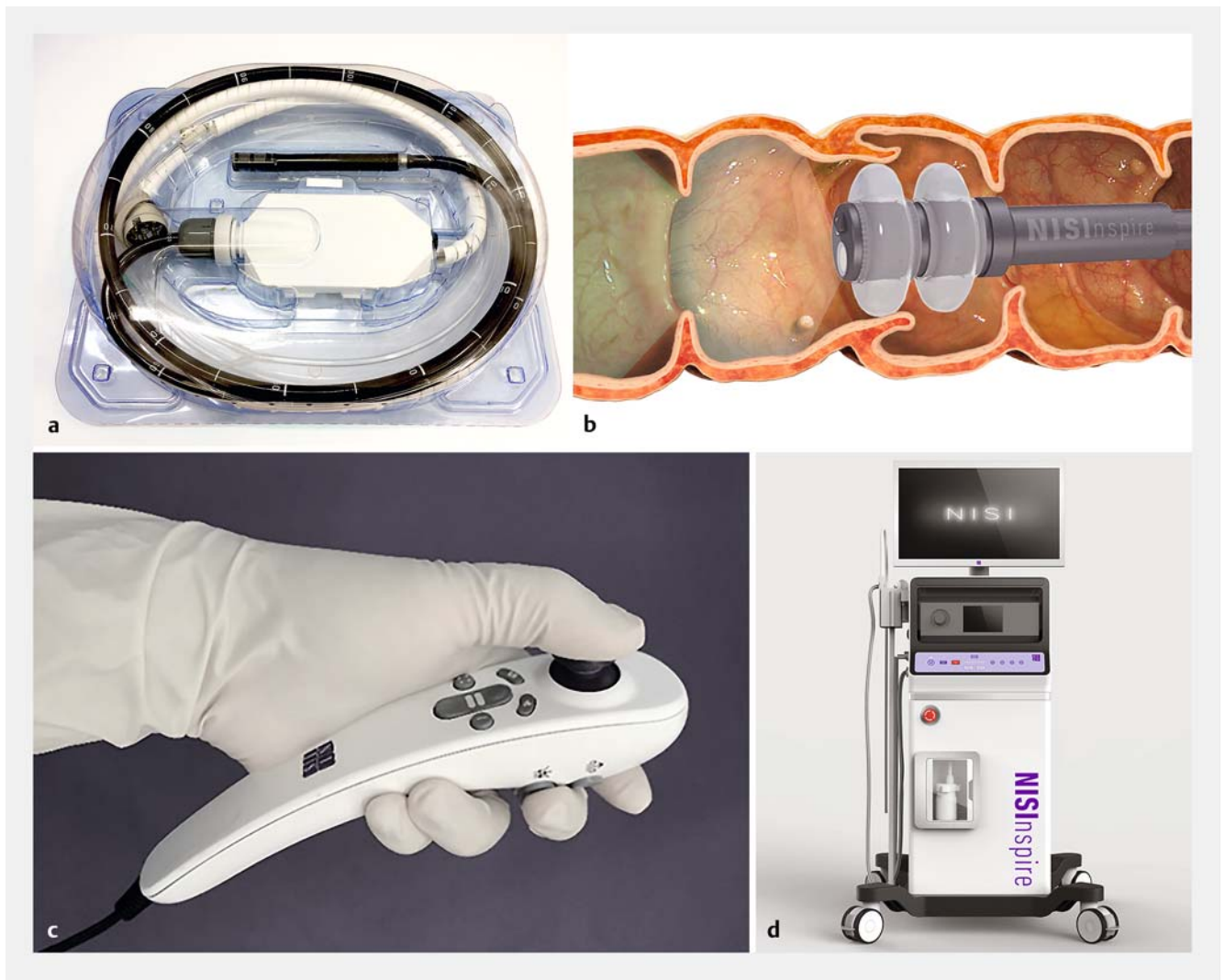
► Fig. 1 The NISInspire-C System. a NISInspire-C colonoscope. b Inflated twin balloons. c Hand controller. d The NISInspire-C console.

The demographics characteristics of the subjects are summarized in ► Table 1 . Fourteen subjects were male (73.7%) and five were female (26.3%). All subjects were Chinese with a mean age of 55.4 years (range: 40–69; SD: 8.5 years). Mean body weight and body mass index were 64.0 kg (range: 43.0–87.7; SD: 11.5 kg) and 23.5 kg/m 2 (range: 17–33; SD: 3.7 kg/m 2 ), respectively. All subjects received monitored anesthesia care. There were seven (36.9%), nine (47.4%) and three (15.8%) subjects with BBPS 8–9, BBPS 6–7 and BBPS 3–5, respectively.