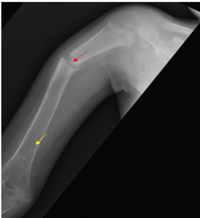
Image 1. Radiograph of the right humerus of a nine-year-old female patient showing demineralization (yellow arrow) and healing fracture (red arrow).

Endocrinology was consulted and elicited on history that she was a picky eater, only eating rice, fries and potato chips. She drank homemade green juices and smoothies but had limited dairy intake. On further review of systems, the family had not noticed any muscle spasms, seizures or twitching. Physical exam by the endocrinologist revealed widened wrists and ankles and rachitic rosary-prominent costochondral junctions of the ribs. She had no symptoms of neuromuscular irritability (negative Chvostek sign) despite ionized calcium of only 0.93